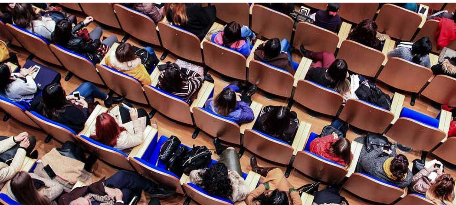
Figure 2 The founding of the OPA at its assembly in 28 January 2017

This law stipulates that in order to practice as a psychologist in the Republic of Albania, it is imperative to be a member of the OPA (i.e., to have completed Bachelor and Master's studies in psychology (both scientific and professional) and to have practiced the profession for one year under supervision, successfully passing the state examination).