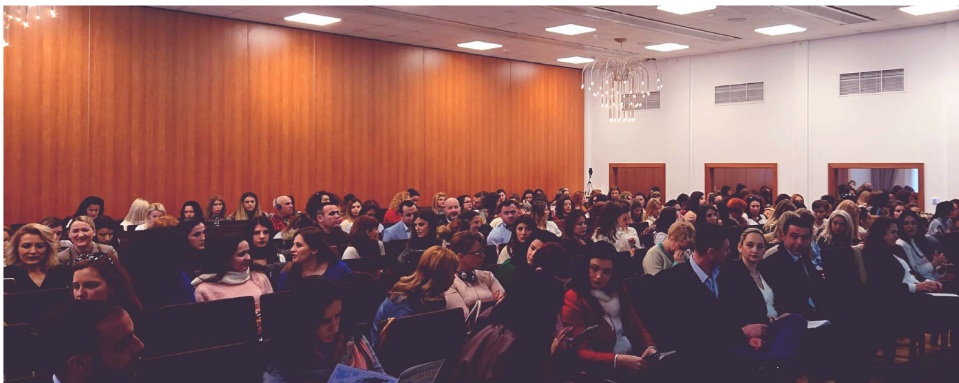
Figure 6 “Role of the work psychologist, tools and areas of intervention”, Tirana, January 2019

tools in psychology. Being aware of their complete lack so far, OPA has undertaken a series of initiatives promoting the standardisation of internationally recognised, valid and reliable instruments. In January, 2018 OPA organised an important activity with regard to WOPs. It was training from “Giuniti psychometrics”, an Italian company providing psychometric tests, on the topic of: “The role of the work psychologist, tools and areas of intervention “; where among other things, several standardised tests were presented in the Albanian language (see Figure 6). This was a popular event with over 130 psychologists attending.