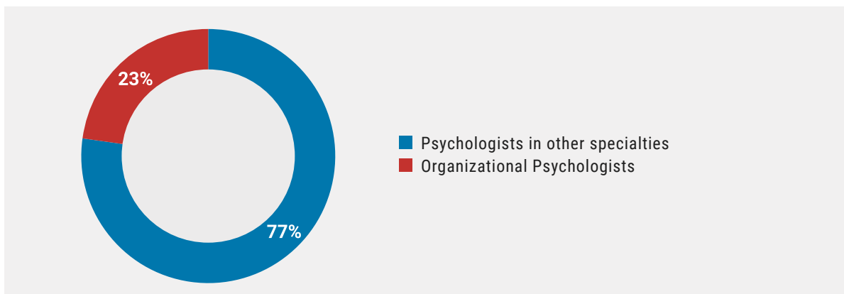
Figure 5 The number of practicing WOPs in Albania

However, regardless of the high number of graduating WOPs, regrettably this profile is practiced by few psychologists in Albania; with only a few individuals being employed by major international companies operating in Albania. The number of such employees is no more than 10 (see Figure 5).